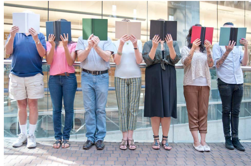
PuSh Festival “The Human Library”