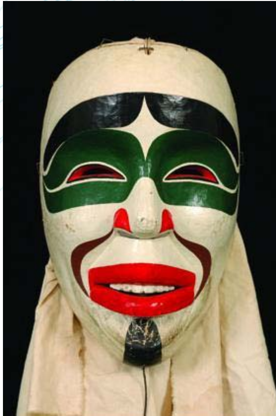
“Irregardless” – Bill Reid Gallery (2012)

Projects that are designed to support and encourage the growth and sustained presence of arts and cultural activities among diverse cultural communities throughout British Columbia.